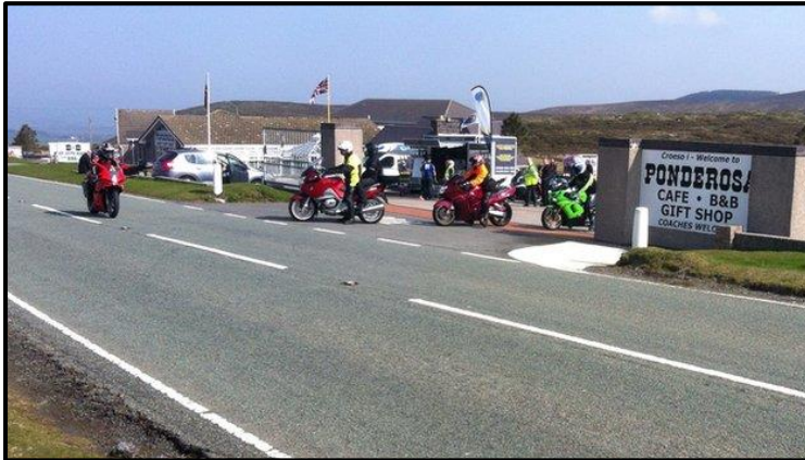
Operation Darwen will focus on popular biker spots - like this Horseshoe Pass cafe

Operation Darwen was launched at a popular bikers' cafe on Denbighshire's Horseshoe Pass.