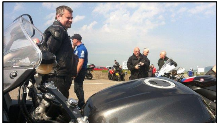
North Wales' roads are a honey pot for bikers who want scenic and challenging roads